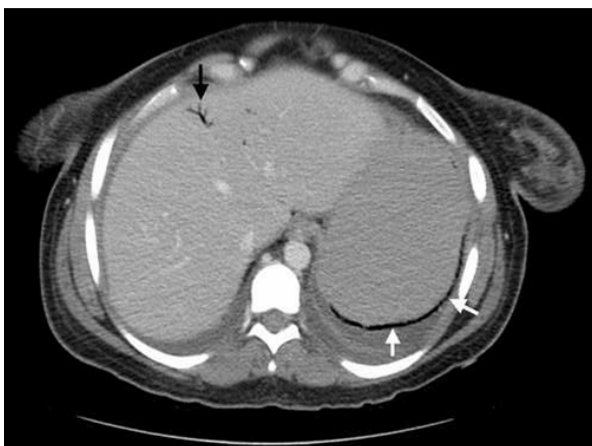
Figure 2 CT of the abdomen showing air in the stomach wall and portal venous system. Black arrow: Portal venous air. White arrows: Air in the stomach wall.

The mechanical theory suggests that gas is forced into the bowel wall through a mucosal defect such as with air insufflation during endoscopy. Our patient had gastric pneumatosis evident on the CT scan even before endoscopy, thus ruling out air insufflation at endoscopy as the source of pneumatosis. The rupture of emphysematous bullae in some patients can cause alveolar air to enter the mediastinum, dissect along the great vessels to the retroperitoneum and through the mesenteric perivascular spaces to reach the bowel wall. Important clues to this clinical situation are the concomitant presence of pneumomediastinum and advanced chronic obstructive pulmonary disease (COPD), which were absent in our patient, thus making a pulmonary process unlikely. Slow-healing mucosal ulcerations caused by ischemia, peptic ulcer disease or inflammatory bowel disease, may also lead to dissection of the luminal gas into the bowel wall