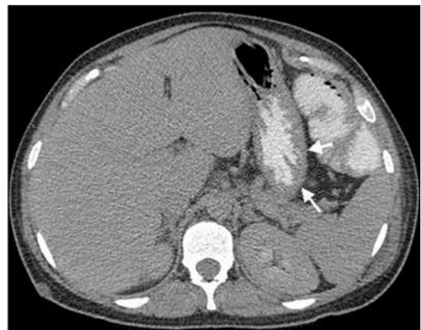
Figure 3 Follow-up abdominal CT on day eight showing resolution of stomach wall and portal venous air.