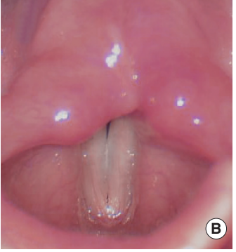
Fig. 3. Telescopic findings on follow-up visit. (A) Normal vocal fold movement and no posterior glottic web. (B) Complete approximation of vocal folds on phonation.

catheters were placed. Soon after, the larynx was evaluated with suspension laryngoscopy. Under microscopic magnification the scar band causing posterior glottic synechia was resected with micro surgical instruments. Topical 0.04% mitomycin C solution was applied with 3 mm-sized cotton balls around the interarytenoid area, to prevent synechia or scarring.