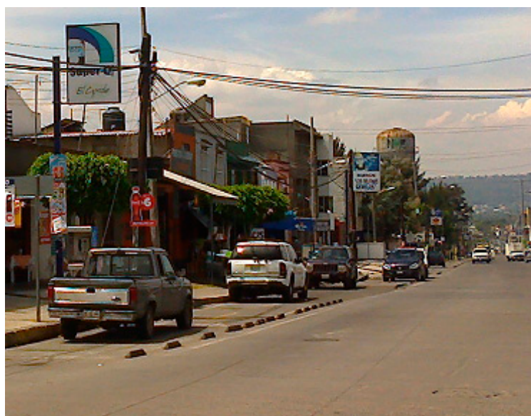
Figure 3. This image was not included in the survey. It shows how drivers park on a cycle track built in the city of Morelia around 2013.

The participants did not prefer invadable cycle tracks due to the possibility that car drivers could drive into or park on these cycle tracks. Individuals in other countries might respect a modest line on invadable cycle tracks, whereas, in Mexico, solid and high barriers are necessary to deter drivers. The participants indicated that separations needed to be large, visible, and not destructible. Even though these cycle tracks were invadable, security improved with the cycle track. For economic development, participants thought having ground floor retail was an economic trigger.