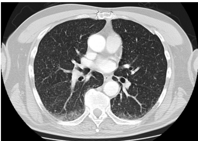
Fig. 2. Computed tomography scan of chest with reported miliary changes.

infection. Subsequently he developed a productive cough and sputum. Blood and early morning urine samples were sent for mycobacterial cultures, prior to commencing rifampicin, isoniazid, ethambutol and pyridoxine 4 days after admission. On this treatment his temperature and cough settled. However, later all his mycobacterial cultures proved negative. Fourteen days after admission he began to develop an unsteady gait. On examination he had new reduced pinprick sensation from the thigh downwards on both lower limbs and also in his fingertips. He had reduced proprioception in both toes and ankles. His reflexes were absent in his lower limbs and diminished in his upper limbs. He