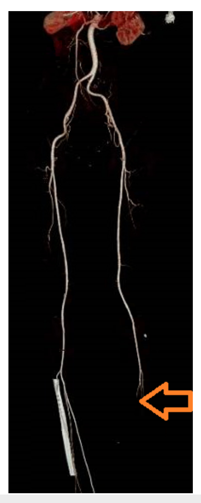
FIGURE 2: CT angiogram of the lower extremities