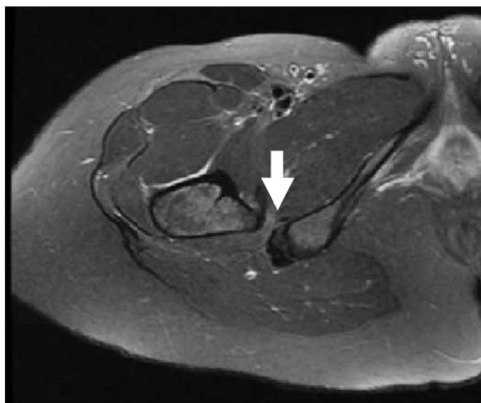
Figure 2 – Female patient, 31 years – Axial T2 MRI demonstrating ischiofemoral space narrowing and hypersignal on the quadratus femoris muscle.