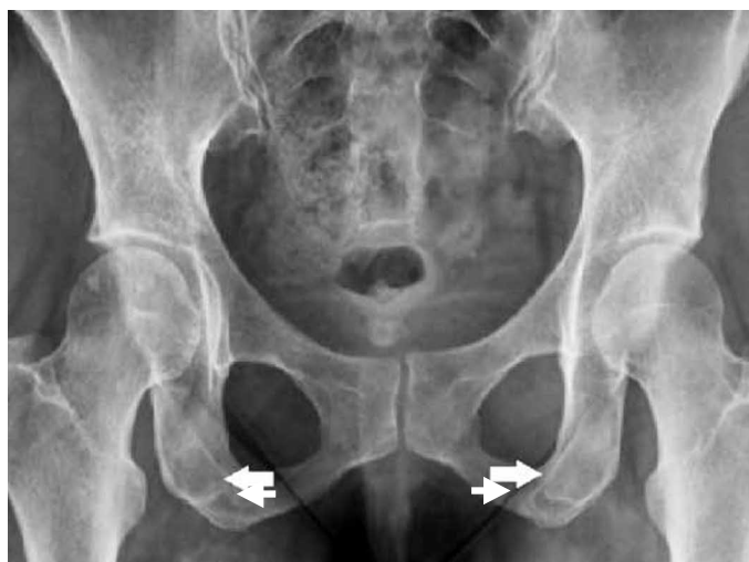
Figure 1 – AP radiograph of the pelvis showing valgus femoral neck, ischial cysts (arrows) and a close relationship between the lesser trochanter and ischium.

Additional tests included radiographic examinations of the pelvis and right hip demonstrating a valgus femoral neck, bilateral ischiofemoral space narrowing, and the presence of cysts in the right ischium (Figure 1). Faced with clinical and radiographic findings and diagnostic uncertainty, we requested a pelvic MRI, which showed increased signal in the quadratus femoris muscle on T2-weighted sequences (Figure 2). Once the diagnosis of ischiofemoral impingement was made, non-surgical treatment was introduced, based on a non-hormonal anti-inflammatory drug for seven days and daily physical therapy for stretching and strengthening the pelvic muscles, with progressive improvement of symptoms. After three months of treatment, the patient showed significant functional improvement, and resumed Pilates activities without any restriction.