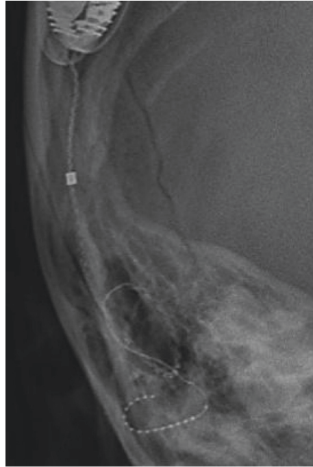
FIGURE 1: X-ray of the right mastoid (frontal view) showing the implant electrode array possibly coiled up in the region of the external auditory canal.