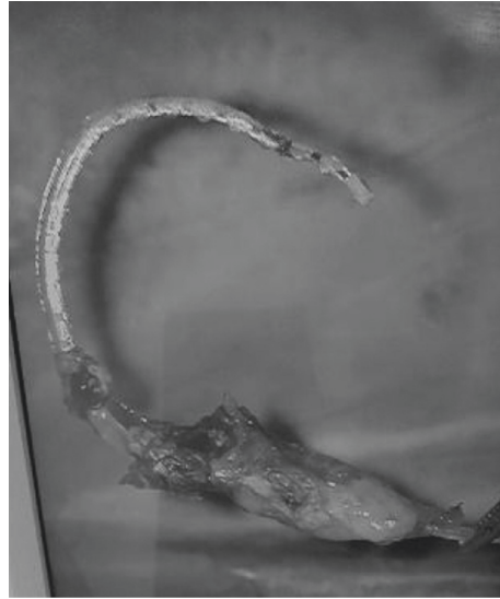
FIGURE 3: Cholesteatoma diseased tissue embedding a part of the electrode array.