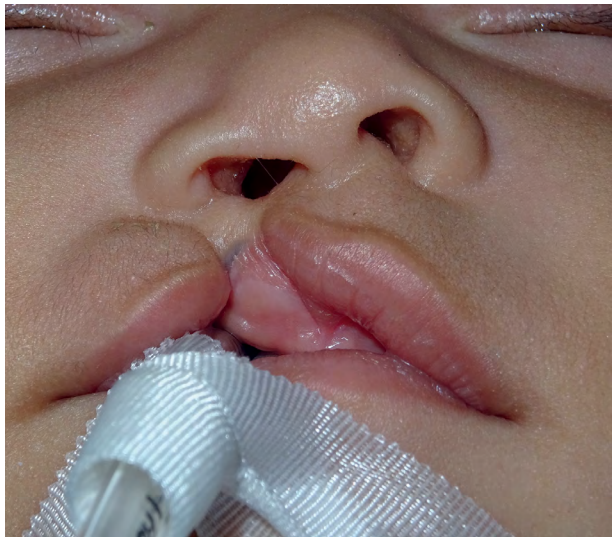
Fig. 3. Preoperative view of a 3-month-old patient with incomplete unilateral cleft lip nose deformity.