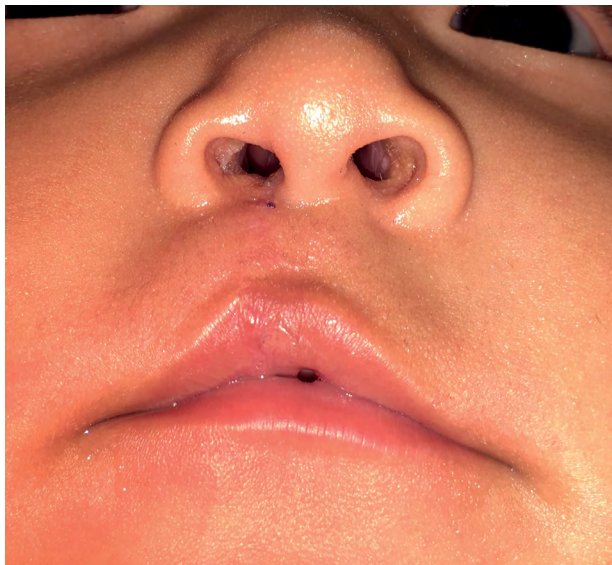
Fig. 4. Postoperative front view of the patient after surgery, illustrating cosmetic improvement of the lip and nose using the proposed method after 1 year.

Complete and incomplete cleft lips are accompanied by different nasal deformities and thereby require different management. Noses in a complete cleft lip necessitate total detachment of the alae, leaving a lateral straight scar. This is associated with a higher risk of scar contracture (a common complication after primary rhinoplasty), which can be avoided using a lateral Z plasty. Furthermore, the