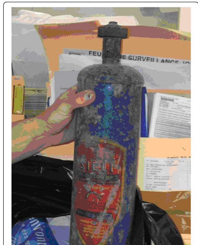
Figure 2 The patient used the old fire extinguisher to unclog his sink, containing methyl bromide.

At day 7, the son of the patient brought us the answer: an old empty extinguisher (Figure 2). The patient used it in the morning of his consultation to unclog his sink and he inhaled the content of the extinguisher, which contained methyl bromide. A blood sample was sent to specialized toxicology laboratory in Paris. The methyl bromide blood level was over 120 mg/L (normal level <0.05 mg/L). Assuming a 12-day half-life for methyl bromide [1], his serum bromide was probably much higher at his admission (7 days before the blood sample).