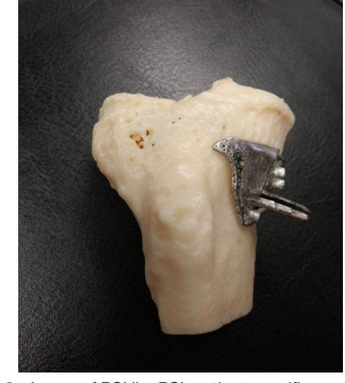
Figure 2 Image of PSI jig. PSI, patient-specific instrumentation.

Three-dimensional printed patient-specific jigs (PSI jig) (figure 2) are created based on the preoperative CT image. Before operation, lower limb from hip to