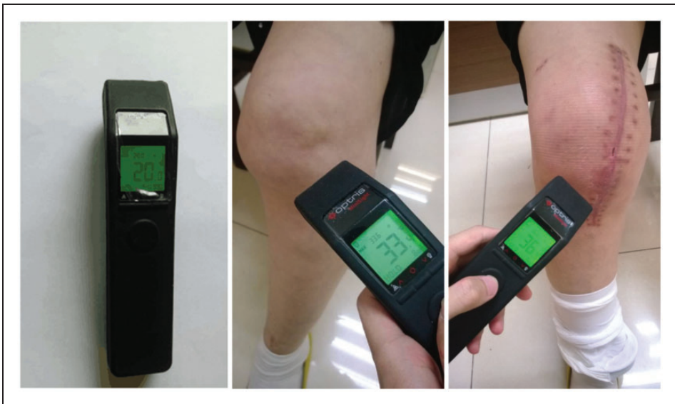
Figure 1. This representative patient underwent total knee arthroplasty 1 month previously. For the skin knee temperature measurements, patients were seated with both knees in 90 degrees flexion in a controlled environment of 20.0 \pm 1.0^\circ\text{C} and 50.0\% \pm 10.0\% humidity. Skin temperature was measured using an infrared thermometer and for this patient showed a 3.1°C temperature difference between the operated and contralateral knees.

Skin knee temperature was measured by one of the investigators (P.D.) on the day before surgery and thereafter at 1, 3, 5, 7, 15, 30, 90, 180, and 360 days postoperatively. For the measurements, patients were seated with both knees in 90 degrees flexion in a controlled environment of 20.0 \pm 1.0^\circ\text{C} and 50.0\% \pm 10.0\% humidity. They were instructed to leave both lower limbs exposed and were acclimatized to the environment for 15 to 20 min before temperature assessments took place. Knee skin temperature was measured between 09.00 h to 12.00 h and between 14.00 h to 17.00 h. Four locations (i.e. superolateral, superomedial, inferiorlateral and inferiormedial border of the patellar) were used and the infrared thermometer was positioned 0.5 cm from these areas (Figure 1). The approximate intra-articular knee temperature was taken as a