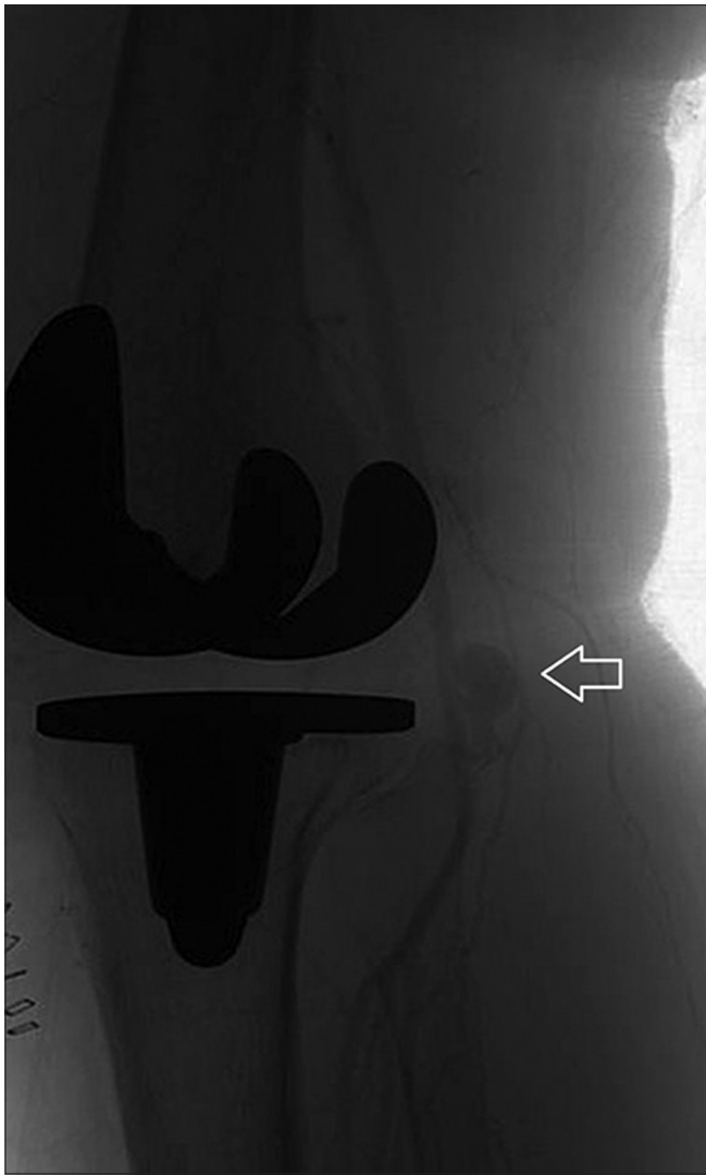
Figures 1: Formal angiogram showing a 1.9 cm pseudoaneurysm (arrow) of the left tibioperoneal trunk

the blood clotting process by facilitating conversion of fibrinogen to fibrin. It is approved for management and control of bleeding from vascular access sites, percutaneous drains, and tissue tracts and has been used successfully in the past to percutaneously occlude a giant splenic artery pseudoaneurysm. [3] In our experience, the high viscosity of this preparation allows greater control of the injection, potentially decreasing the risk of intra-arterial thrombotic events which have complicated a very small proportion of thrombin injections. [4] The avoidance of arterial access such as is required for endovascular stenting and coiling decreases the risk of concurrent arterial access site injury. Furthermore, many authors discourage the use of covered stents across mobile joints due to high occlusion rates (up to 21%) at 24 months. [5] As the patency rates of stents are improving as newer generation stents are developed, there is the ongoing requirement for patients to be medicated with aspirin and/or clopidogrel, both of which carry their own inherent risks. Lastly, with this technique, the general