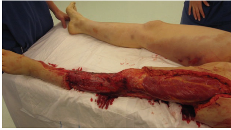
FIGURE 3: This figure shows patient 1's extensive debridement of the left lower leg following identification of necrotic tissue. This theatre picture at the second look also shows the skin changes developing on the right leg, a late clinical sign.