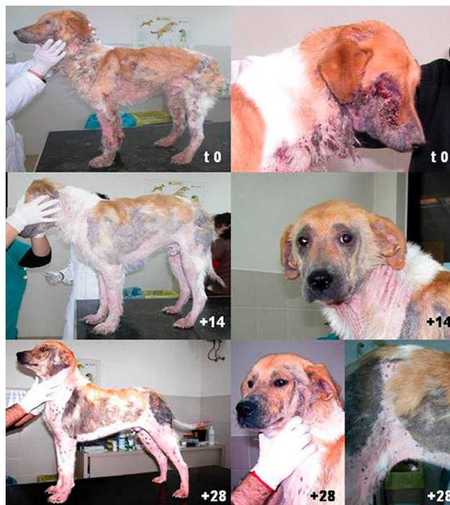
Figure 1 Patient at day 0 (before treatment) and on day +14 and +28, post treatment.

In February 2008, a two year-old male mixed-breed dog, weighing 18 kilograms, was referred by the owner to the Parasitological Unit of the Faculty of Veterinary Medicine of Bari (Apulia region, Southern Italy). The animal presented with poor general condition and showed lymphnode enlargement and fever (40°C). The dog exhibited seborrhoea on the whole body surface with extensive areas of alopecia, crusted lesions which were more severe on the legs, neck and face, and pruritus (Figure 1). In particular, the patient showed diffused bleeding wounds around the eyes and serious traumatic corneal lesions. Based on the animal's history and physical examination, the differential diagnosis included ectoparasitic infections, leishmaniosis, neoplasia, mycobacteriosis, dermatophytosis and combined anaerobic and aerobic bacterial