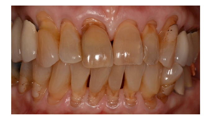
Figure 3 An elderly patient exhibiting NCCLs in the whole dentition. Abbreviation: NCCL, noncarious cervical lesion.

margins, beyond the reach of a toothbrush or other devices that could cause frictional forces, are also believed to have biomechanical loading forces as a major contributor.<sup>9</sup> Likewise, a single tooth in a quadrant with an abfraction lesion is an indication that occlusal stress might be the primary contributing factor.<sup>9</sup>