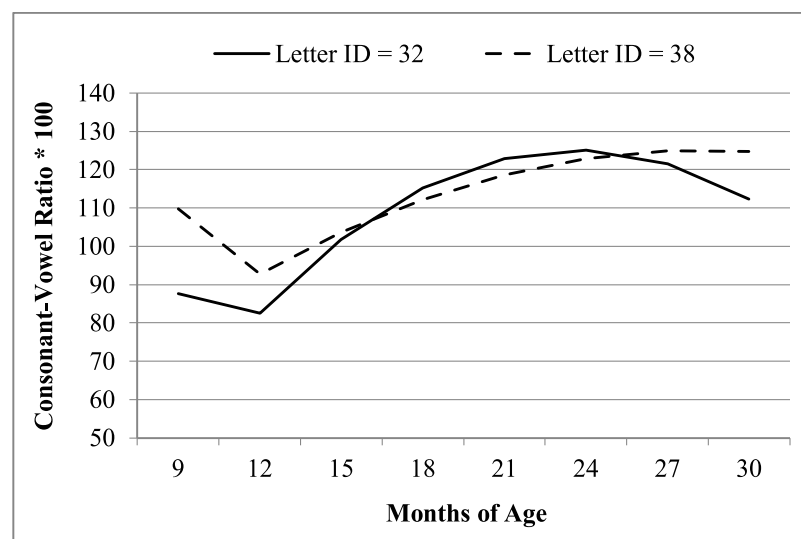
Fig 2. Predicted means of early speech production scores for children with high and low letter identification.

Orthographic learning offers another explanation for the relations between early speech production skills and later letter identification abilities. The relation between phonology and orthography is reciprocal; just as children need to learn how phonology maps onto orthography, they also must to learn the different ways that orthography maps onto phonology. During early reading development, children are able to acquire rudimentary mappings from a word's letter sequence to its pronunciation and vice versa. Our data support a strong association