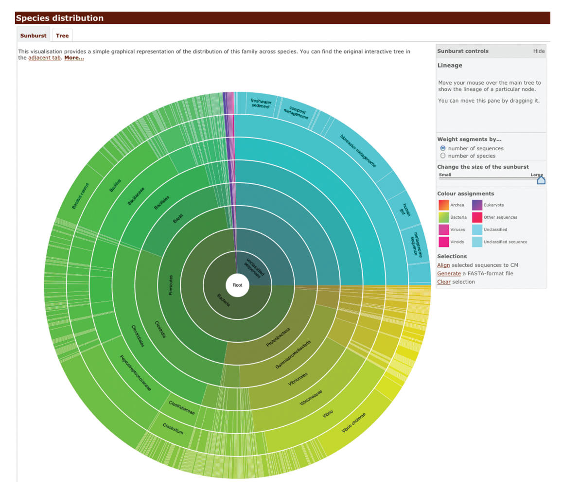
Figure 3. Sunburst visualization of family taxonomy for RF01051, the cyclic di-GMP-I riboswitch. Users may select regions of taxonomic space and use the controls on the left to download an alignment of their chosen subset of species.

A Biomart is a federated database system which aims to facilitate exploration and interrogation of large biological datasets (16). It has been adopted by many biological databases, such as Ensembl (17) and the Mouse Genome Database (18). Our aim in creating a Biomart was to make available sophisticated query technology in a user-friendly format; currently, the Rfam website only allows relatively simple querying by (e.g.), family accession, general search term, taxonomy or family type. Search parameters are referred to as filters, and the data requested are referred to as attributes. Available data filters and attributes are shown in Figure 3. The Biomart allows more complex