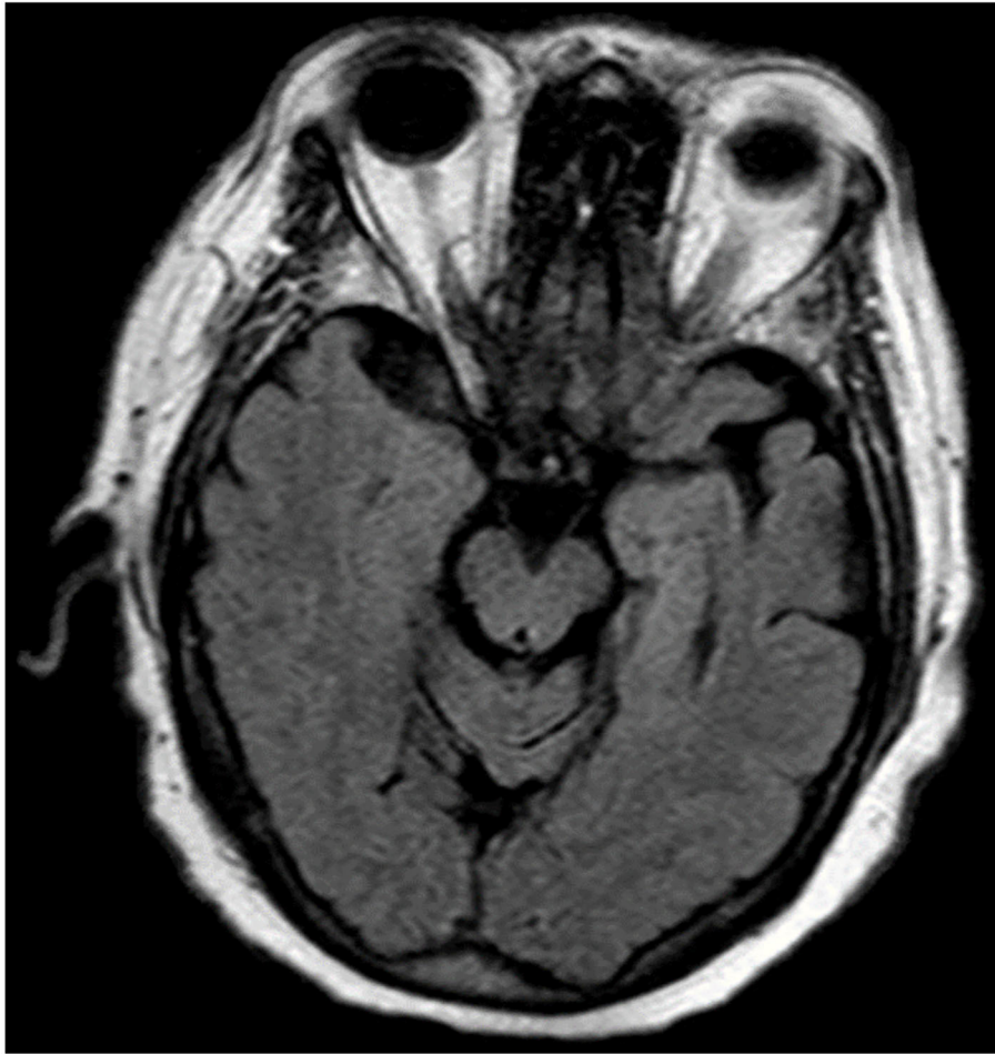
FIGURE 1 | The patient's magnetic resonance imaging revealed low brain volumes in the anterior temporal lobe and frontal lobes.

factors for suicide in the elderly: white race, male sex, medical disability, cognitive decline, military veteran, and access to firearms and ammunition (23). There is less data regarding how FTD contributed to his risk of suicide. Several small studies have shown that suicide risk might be significantly higher in FTD (16, 17). Characteristic phenotypic differences between AD and FTD have been used to explain this risk including preserved insight, higher neuropsychiatric burden, and, on average, a significantly younger age of onset (younger age may be associated with less oversight, functional impairment, and increased ability to carry out suicide). Retained insight, in particular, seems to be a key risk factor for suicide in all forms of dementia and the primary reason suicide risk seems to be highest in the first year after a diagnosis (24). Individuals with PPA have better insight which may manifest as frustration, depression, and hopelessness as individuals increasingly struggle to communicate (25).