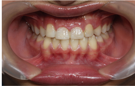
FIGURE 6: Gingival appearance after gingivectomy.