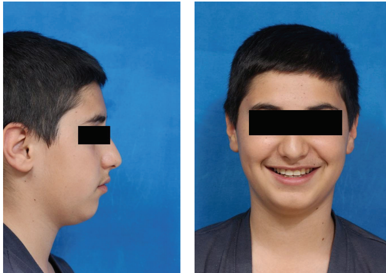
FIGURE 4: Posttreatment facial photography.