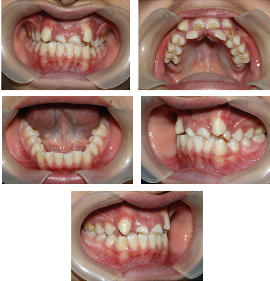
FIGURE 3: Pretreatment intraoral photography.