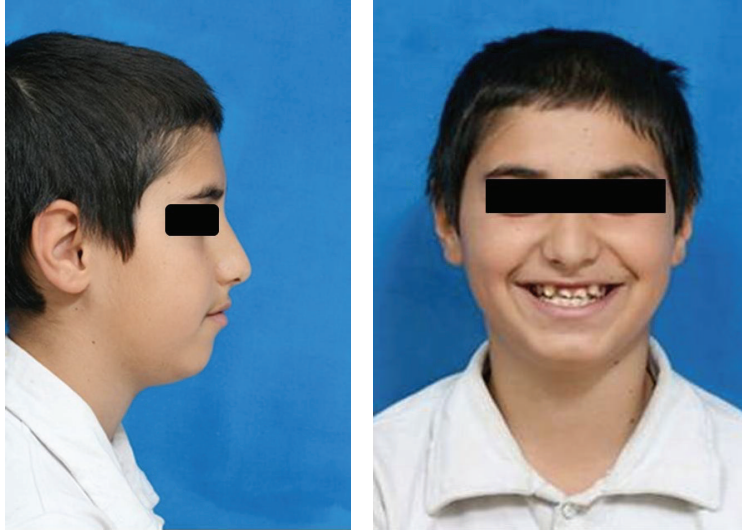
FIGURE 1: Pretreatment facial photography.