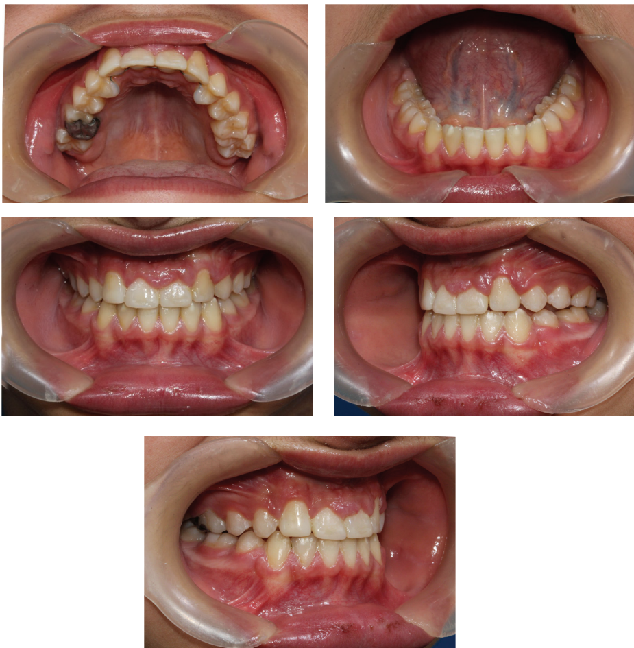
FIGURE 5: Posttreatment intraoral photographs.