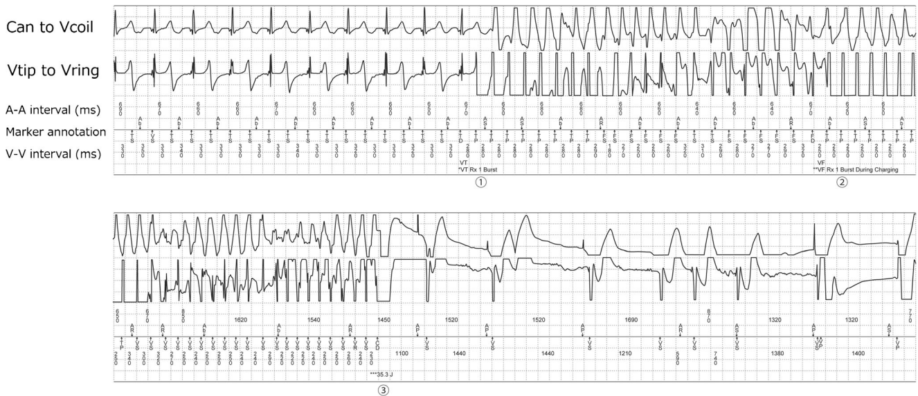
Fig. 2 An ICD-stored intracardiac electrogram. A 61-year-old man that had dilated cardiomyopathy and chronic hemodialysis received an ICD (Secura DR, Medtronic) for secondary prevention in 2009. In 2011, he had chest discomfort and unconsciousness, followed by a shock delivery at work. A stored electrogram shows that the sinus tachycardia with T wave oversensing with a cycle length of 330 ms triggers a burst of ATP (① VT Rx 1 Burst, cycle length of 280 ms). This results in an acceleration

to a tachycardia with a 250 to 320-ms cycle length, with a subsequent burst of ATP (② VF Rx 1 Burst During Charging, cycle length of 250 ms). This therapy degenerated the VT into VF, which required shock therapy for termination (③ 35.3 J). His creatinine was 12.1 mg/dL, and serum potassium was 7.0 mmol/L at admission. The upper and lower electrograms are continuous recordings. ATP antitachycardia pacing, VT ventricular tachycardia, VF ventricular fibrillation