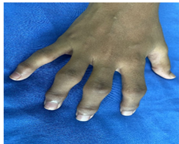
Fig. 2 Swelling of the proximal and distal interphalangeal joints of the right hand; non-erythematous and non-tender

height on presentation were below the third percentile, and upper-to-lower body segment ratio was 1. On examination, the patient was in generally fair condition. She had marked prominence (swelling) of proximal (PIP) and distal interphalangeal joints (DIP) bilaterally, which were non-erythematous and non-tender (Figs. 1,2). However, there was limited mobility of the joints. Swelling of the knee and elbow joints bilaterally was also noted. She also had scoliosis on presentation.