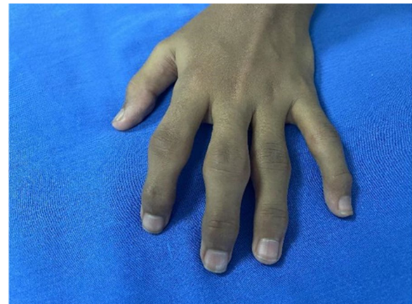
Fig. 1 Swelling of the proximal distal interphalangeal joints of the left hand

Initially, at the age of 9 years, she presented to the general practitioner with joint and bone pains. She was diagnosed with juvenile idiopathic arthritis and treated with non steroidal anti-inflammatory drugs (NSAIDs). However, her condition kept deteriorating despite the NSAIDs for 4 years, and she was referred to a pediatric rheumatologist for further management. Her weight and