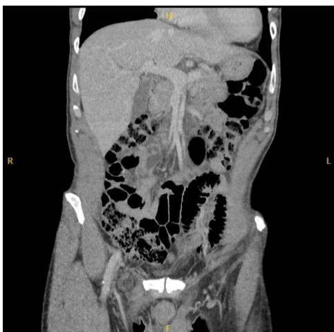
Figure 2. Coronal CT image of right De Garengeot hernia.

these patients. The intraoperative findings varied significantly from the more reassuring radiological findings. One possibility is the appendix at the time of the CT may