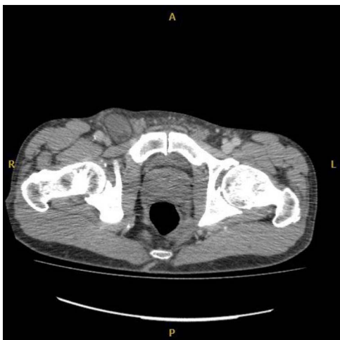
Figure 1. Axial CT image of right De Garengeot hernia.