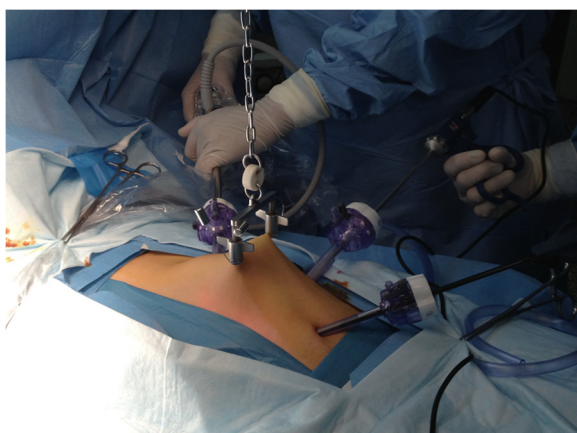
Figure 2 The position of lifting device and all three trocars.

After identification of the appendix, the mesoappendix was coagulated with bipolar diathermy and cut. The base of the appendix was crushed and clipped with a Hem-o-