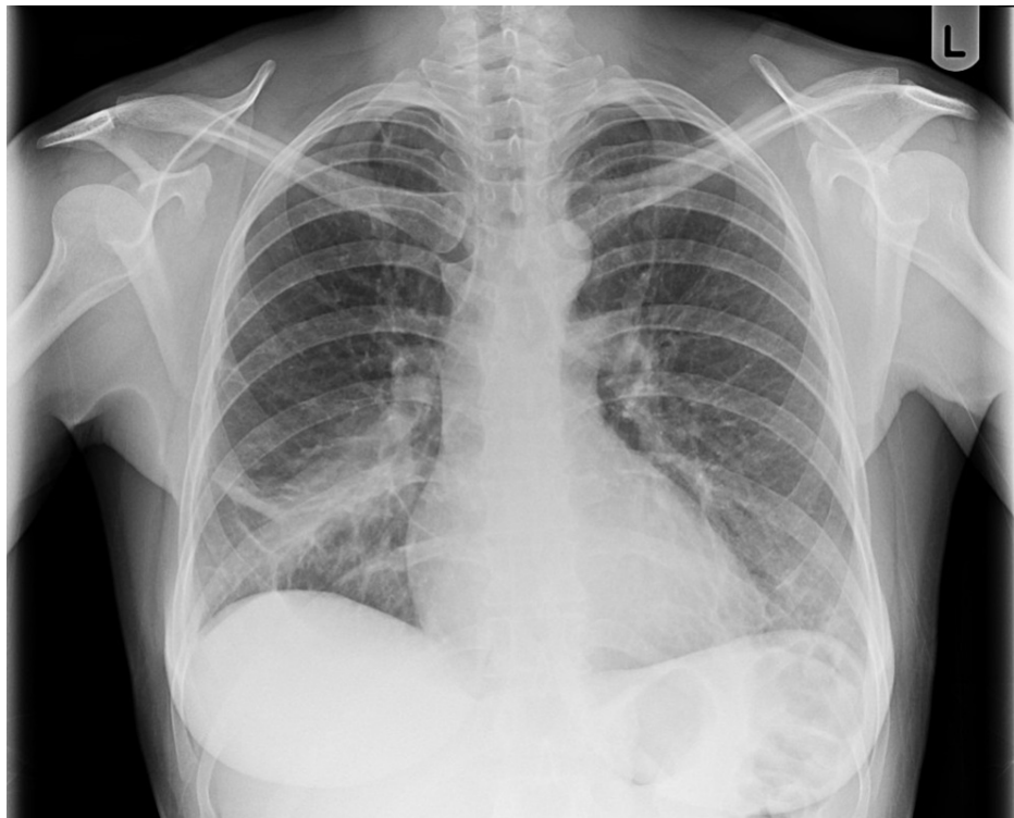
FIGURE 4: Chest X-ray one month after discharge.

Chest X-ray taken one month after discharge from hospital demonstrating only partial improvement in consolidation.