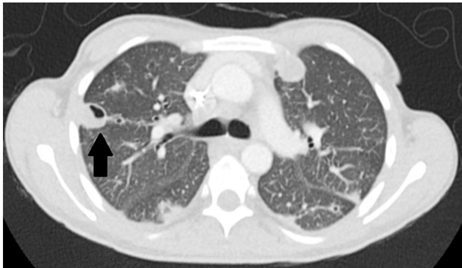
FIGURE 2: Chest CT with contrast.

Chest CT scan demonstrating septic emboli (arrow).