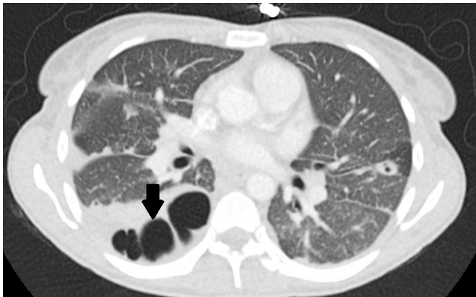
FIGURE 3: Chest CT with contrast.

Chest CT scan demonstrating septic emboli (arrow).