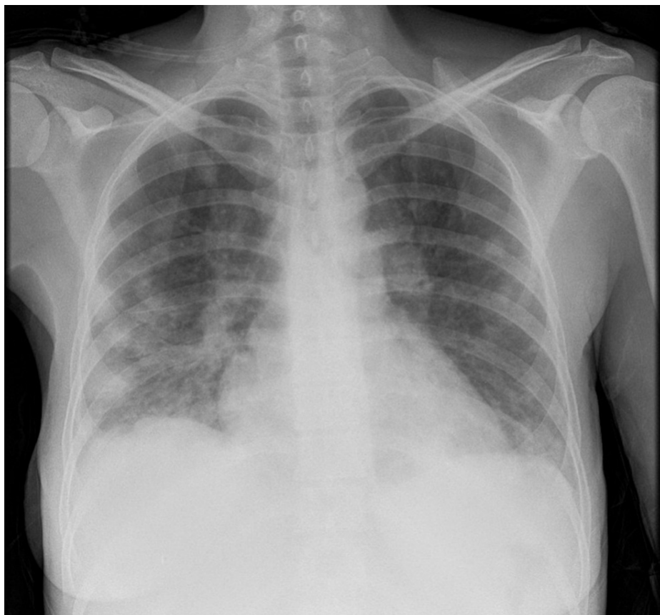
FIGURE 1: Chest X-ray on presentation.

Chest X-ray taken on presentation at the Accident and ED showing focal consolidation in both lung fields in keeping with severe community-acquired pneumonia.