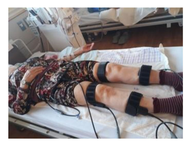
Figure 2. Application of the belt electrode-skeletal muscle electrical stimulation intervention. Patients were placed in the supine position. Five silicon–rubber electrode bands were applied to the patient's waist and bilateral thighs and ankles. Electrical muscle stimulation was administered for 40 min per day.

B-SES was performed using G-TES (Homer Ion Institute Co., Ltd., Tokyo, Japan), which is an electrical stimulator for general treatment (Figure 2). The stimulation was carried out in "Obsolete mode" (frequency: 20 Hz, on-off: 5 sec–2 sec, pulse width: 250 \mu s, output waveform: exponentially increasing wave) for 40 min per session, according to the median time reported in a previous study by Schardong et al. [14]. All other stimulation conditions were in accordance with a previous study by Suzuki et al. [17].