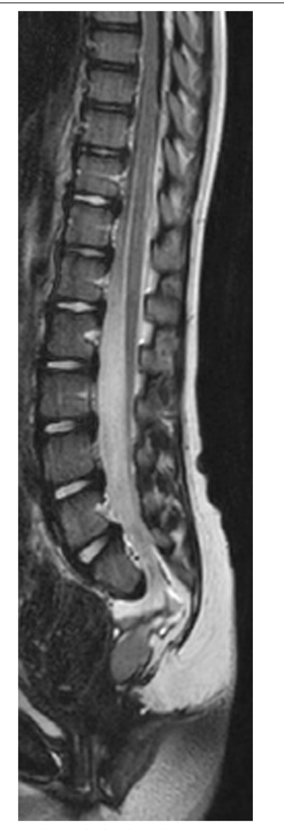
Fig. 1 Sagittal t2- weighted Lumbosacral MRI

The patient underwent a neurosurgical operation with the indication of cord untethering. After the surgical treatment, constipation improved and encopresis regressed. Clinical follow-up is still ongoing.