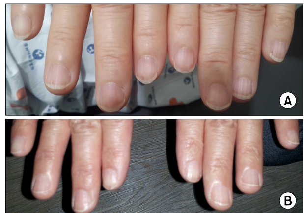
Fig. 4. Splinter hemorrhage. (A) Preoperative findings. (B) 6 weeks postoperatively.

bypass was established with aortic and bicaval cannulation. After transverse aortotomy, we found huge vegetations on 3 aortic cusps and a small aortic wall abscess in the aortic wall above the noncoronary cusp. The aortic valve was severely damaged, so we