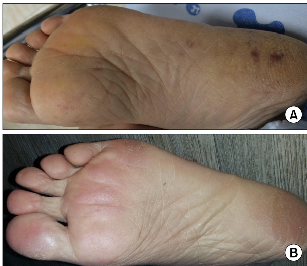
Fig. 3. Janeway lesions. (A) Preoperative findings. (B) 6 weeks postoperatively.

bypass was established with aortic and bicaval cannulation. After transverse aortotomy, we found huge vegetations on 3 aortic cusps and a small aortic wall abscess in the aortic wall above the noncoronary cusp. The aortic valve was severely damaged, so we