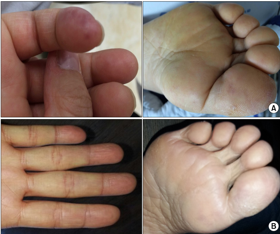
Fig. 2. Osler nodes. (A) Preoperative findings. (B) 6 weeks postoperatively.