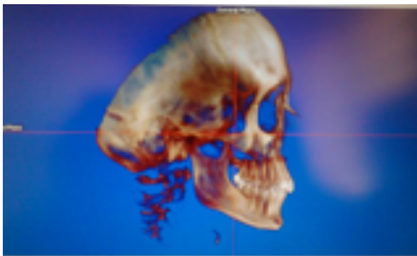
Fig. 2: Calibration of the head in the lateral view.

- Hormion: The point of union of the sphenoid bone with the posterior border of the vomer (the most superior border of the pharyngeal airway) (Fig. 3) - Posterior nasal spine (Fig. 3): The most inferior point of the skull base (basion) - Line passing from the most superior and most anterior point of the fourth cervical vertebra and posterior wall of the pharynx parallel to the Frankfurt plane (Fig. 3). After outlining the airway and parallelizing it with the Frankfurt plane, the slider tool of Dolphin 3D software was used to determine the sensitivity of the software for differentiation of the airway and the surrounding soft tissue and detecting the difference in resolutions of the pharyngeal airway. Since the size of the airway is not the same in different individuals, sensitivity is also variable. To confirm this hypothesis, we first determined airway sensitivity in 10 individuals and found that this hypothesis was correct. Thus, in order to minimize errors in outlining the airway, we initially determined the first sensitivity encompassing the entire airway area separately for each individual. In other words, in this sensitivity, the software was capable of showing the upper and lower compartments of the airway within the outlined area. This sensitivity was recorded as the minimum acceptable sensitivity for measurement of the