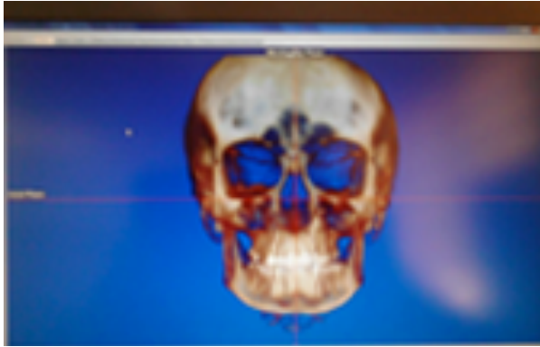
Fig. 1: Calibration of the head in the frontal view.