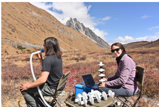
FIG. 2. Photograph illustrating the experimental setup of the respiratory interoception (filter detection) task in Sikkim, India. Actual experiments were performed indoors in a hotel room.

Cardiorespiratory physiology. Basic measures of cardiorespiratory physiology were made noninvasively using pulse oximetry and an automatic sphygmomanometer, measuring oxygen saturations, heart rate, and blood pressure. These measures were collected each morning on the expedition as part of a daily medical review.