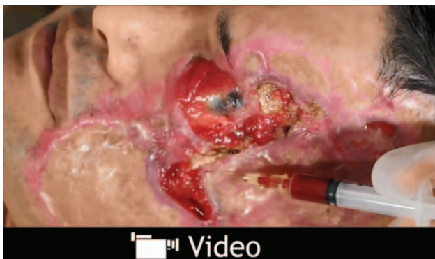
Video Graphic 1. See video, Supplemental Digital Content 1, which displays an injection into the surface of the ulcer of the medial region through a 30-gauge needle. This is performed once a week, http://links.lww.com/PRSGO/A281 .

A 61-year-old woman sustained a burn caused by heated oil to her left hand. She was diagnosed with a superficial second-degree burn of the fourth finger and third-degree burn of the fifth finger. She received debridement for the fifth finger on day 3 after injury, resulting in tendon exposure (Fig. 2A), and we began treatment using PFC-HA. After preparation in the same manner as described above, the weekly injection of 0.3 mL of PFC combined with 0.2 mL of non-cross-linked HA was performed into the wound surface of the fifth finger. After 2 sessions of treatment, the wound had almost completely closed, whereas the fourth finger healed with standard conservative treatment but left a hypertrophic scar (Fig. 2B).