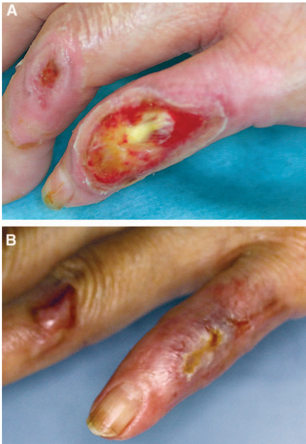
Fig. 2. A, Intraoperative view, after debridement on the third day after burn injury. The tendon on the extensor digiti minimi was exposed. B, Posttreatment view at 2 weeks. Two sessions of PFC treatment had almost completely healed the ulcer.

sumed to keep PFC around the ulcer and continuously releasing PDGF: as PFC is in a liquid form, its effects must be released slowly. 6 Although further evaluation is necessary, PFC–HA treatment is easy to apply, safe, and an effective choice to heal deep burn wounds that are intractable to conventional conservative treatment, and it may be promising for the treatment of refractory ulcers.