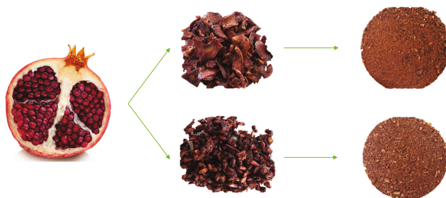
FIGURE 2: Visual aspect of the dried and ground pomegranate by-products: (a) peels and (b) seeds.

2.4. Qualitative Phytochemical Analysis. For qualitative phytochemical analysis, the freeze-dried extracts were resuspended in distilled water (0.02 g/mL) and screened for the presence of phytochemical families of compounds according to the methods described by Vesoul and Cock [31].