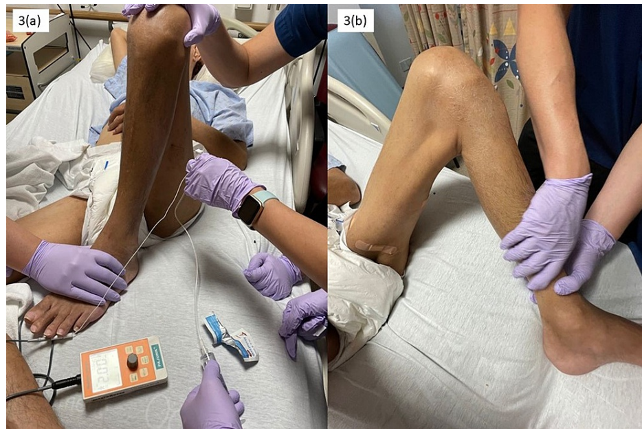
FIGURE 3: Clinical photos illustrating alcohol motor point injection of the left hamstrings and left knee extension passive ROM pre and post-injection.

lower limbs, which kept him in a flexed position (Figure 3, Panel a). There was pain during the transfer from the bed to the wheelchair, and the caregiver encountered challenges in lower body dressing due to flexed knee and skincare of the popliteal fossa.