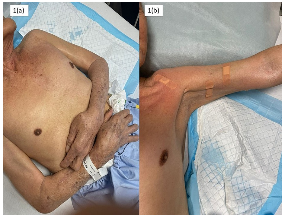
FIGURE 1: Clinical photos illustrating left upper extremity posture pre and post-alcohol neurolysis and intramuscular nerve blocks.