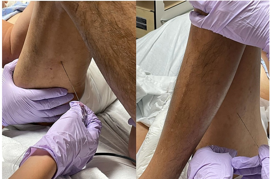
FIGURE 4: Clinical photos illustrating alcohol motor point injection of bilateral hamstrings.

(a) Right hamstring alcohol motor point injection; (b) left hamstring alcohol motor point injection.