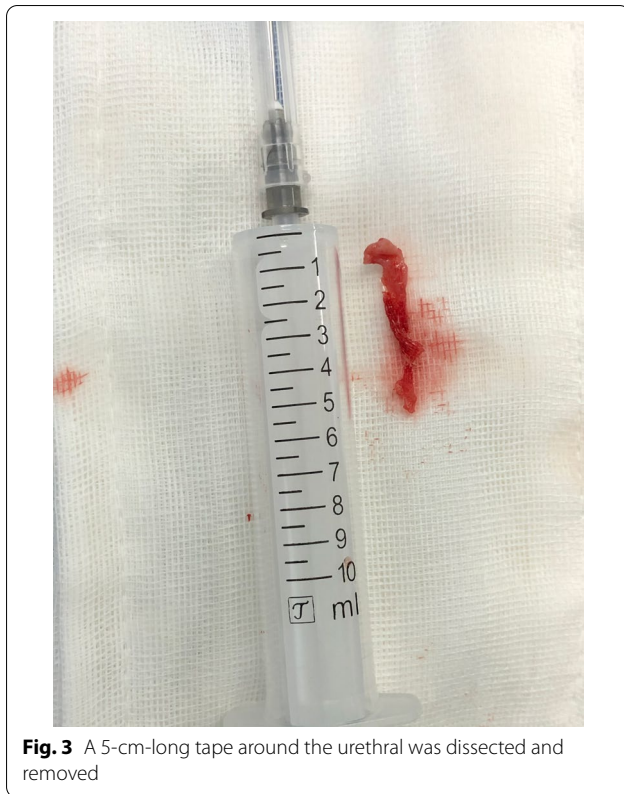
Fig. 3 A 5-cm-long tape around the urethral was dissected and removed

include wound infection, excessive sling tension, small mesh pore size, poor mesh incorporation, radiotherapy, postoperative vaginal atrophy, and premature sexual intercourse after operation [7–9]. Risk factors for erosion are the length of vaginal incision > 2 cm, recurrent vaginal incision for postoperative complications, and previous pelvic organ prolapse or incontinence surgery [7]. In our case, none of the above reasons can explain the mechanism of rapid SUI recurrence and later tape erosion. We verified in surgery that the right arm was in the proper layer of the vaginal wall and had no erosion. The left arm of the tape, however, was wrongly put in the vaginal mucosa layer rather than between the whole thickness of vaginal mucosa and urethral. Thus, shallow placement of the tape may cause rapid recurrence of SUI and vaginal tape erosion. In order to get the correct anatomy for the tape placement, we usually inject 10–20 ml saline into the vaginal mucosa. The incision should be deep enough to separate the whole thickness of the vaginal wall. Blunt dissection is recommended by using tissue scissor. It's important to make sure that the bilateral tissue tunnels for the tape placement are in the same layer of the vaginal wall. After dissection of the vaginal mucosa, the urethral should be in integrity.