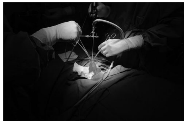
FIG. 1. A pair of Allis clamps secured at the edge of the scrotal incision to avoid leakage around the incision.

No bleeding of scrotum, testicular atrophy, or relapse of testicular torsion was documented. All 14 patients were followed for as much as 2 years (range 6–47 months). Under