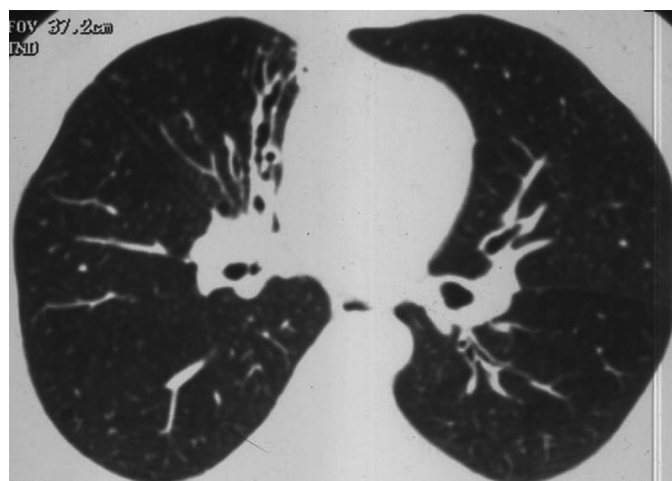
FIG. 1. Bronchiectasis is seen at right paramediastinal area.

Arsenic is accepted as carcinogenic for the lung by the International Agency for Cancer Research (16). Different studies found that lung cancer incidence in arsenic-exposed people was 3.7% and 8.8% (3,17). The malignancy ratio of CT-detected pulmonary nodules was reported as 1.1-12% (18). In our study, the most frequent finding in HRCT was pulmonary nodules, giving support to the statement that arsenic-exposed patients should be followed more carefully.