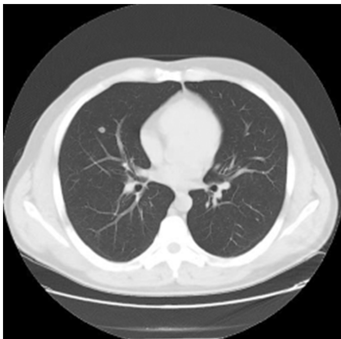
FIG. 3. There is a parenchymal solitary pulmonary nodule in the middle lobe of the right lung.

The main limitation of our study was that 79% of pulmonary involvement workers were smokers. Smoking is one of the factors affecting DLCO. At least 24 hours before the DLCO test, patients should refrain from smoking; however, not all patients comply with this warning. As a result, smoking may contribute to the decline in DLCO in pulmonary involvement patients.