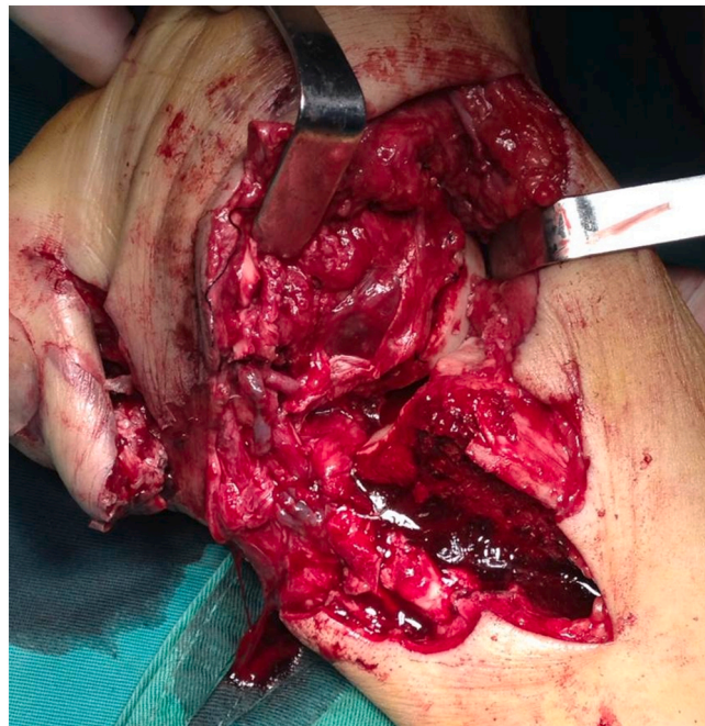
Fig. 8. The periosteum was transplanted to cover the cartilage defects of the talus.

Xiamen Superior Sub-construction project of Arthroscopic minimally invasive Orthopedics department. Xiamen Key Specialty construction project of Traumatic Orthopedics department.