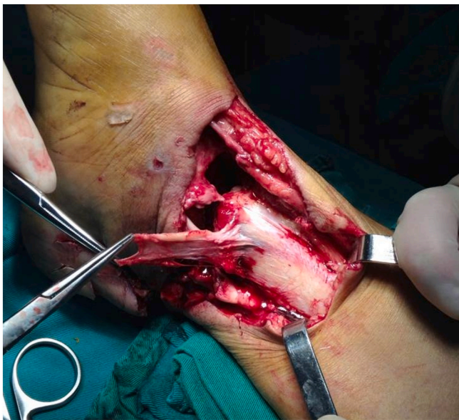
Fig. 5. The periosteum was cut 2.5 * 6 cm in size.