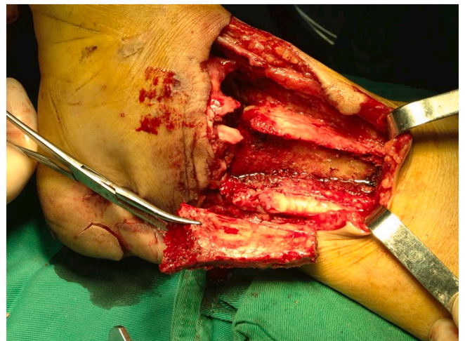
Fig. 6. The size of bone block was made about 2.5 * 6 * 1 cm.