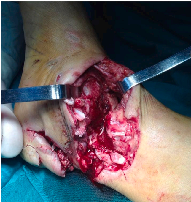
Fig. 2. The medial malleolus, Part of the Talus's cartilage and soft tissue were defect. The anterior tibial artery was cut, and the anterior and posterior tibial tendons were ruptured.