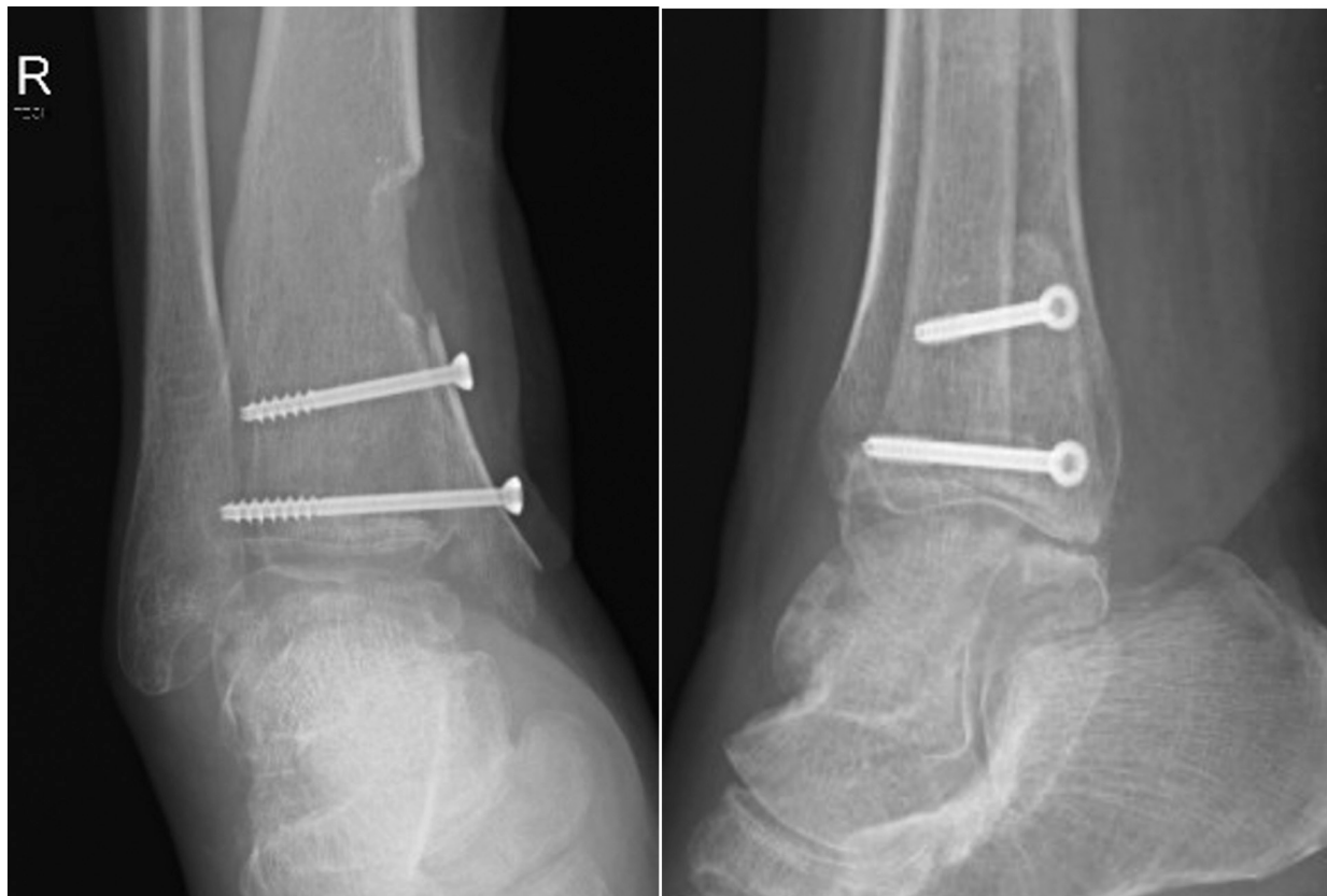
Fig. 10-11. The radiographs from 6-month follow-up showed consolidation of the sliding bone block.