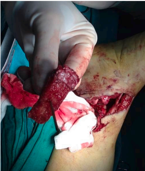
Fig. 7. The distal end of the bone block was modified to simulating the shape of the medial malleolus, and the periosteum was transplanted to cover 2 cm distal end of the bone block to simulate the medial malleolus cartilage.