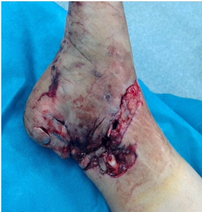
Fig. 1. The skin of medial ankle was severe contaminated with mud, and the skin cover was acceptable.