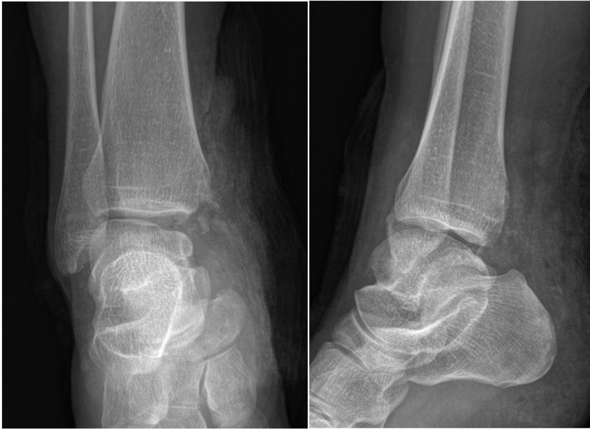
Fig. 3-4. Pre-operation X ray with loss of medial malleolus.