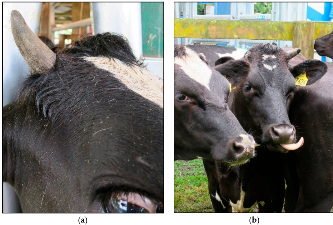
Figure 1. Image (a) is a picture of a normally developed horn that was not disbudded and (b) is a picture of a scur that developed after clove oil was injected subcutaneously under the horn bud at approximately 4 days of age.

The cross-section of a normally developed, non-disbudded (untreated) horn consisted of an outer layer of cornual epidermis, followed by a dermal layer, a fibrous tissue layer and a cornual diverticulum (Figure 2a). The internal characteristics of the scurs from CLOV treated buds, that looked like a normally developed horn but were not attached to the skull, were similar to the normal horn but did not have a cornual diverticulum (Figure 2b) and this was also similar for scurs from CLOV treated buds that looked like small deformed horns (Figure 2c).