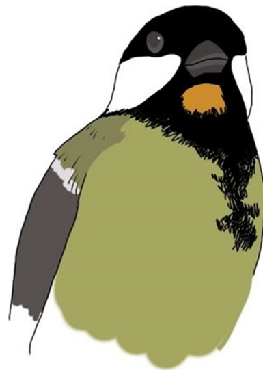
Fig. 2 Position of the yellow mark on a great tit's chest. The blue and pink marks and black sham mark were positioned in the same way (colour figure online)

Upon completion of training, we marked the bird with either a coloured or black mark on the uppermost part of its chest (Fig. 2) where it cannot be seen directly by the bird. During the colour application process, one experimenter held the bird in one hand and applied the mark with the other. We held the bird with its breast upwards and the back of the hand resting against a desk. Holding a small bird this way makes it easy to cautiously fixate its head by holding the index finger and the thumb on each side of the beak. This procedure means that the fingers of the experimenter will block the bird's view of the underparts of its body so that it cannot see the application of the mark. We used this mark location in accordance with Prior et al.'s (2008) experiment on magpies. The black mark was a "sham" mark as control against tactile effects since the area around the position of the mark is black on the great tit. We tested several types of dye and tapes before the experiments in order to find some that appeared not to be sensed by the birds. We evaluated this by releasing the marked bird in its home cage and observed whether it