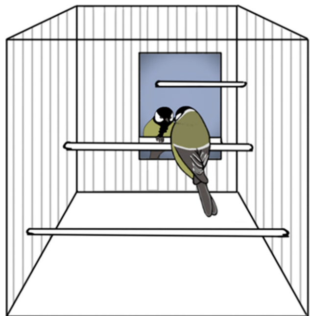
Fig. 1 Position of the mirror in a great tit's home cage. Observe that the drawing is not made to scale; the mirror was smaller than it appears in the figure (see text)

The study consisted of two phases: five training sessions and then a mark-test session. We recorded all training and test sessions in Lund with a Sony Action Cam HDR-AS200VT and in Prague with a Canon HG20 camera. The cameras were mounted approximately 20 cm from the cage's short end angled slightly downward so that they provided good views over the whole cages and their floors. Training sessions lasted 20 min in both Lund and Prague, and we started each such session by introducing a vertically positioned mirror in the focal bird's home cage (Fig. 1). The mirrors we used were 15–18 cm high and 10–16 cm wide and mounted against a wall of the cage. As it was hard to determine precisely where a bird was looking or sometimes even its specific behaviour, we analysed the bird's behaviour afterwards by watching the recordings. The playback was repeated or slowed down if the behaviour of a bird was difficult to categorize. We categorized the bird's behaviour in accordance with a similar study on birds (Prior et al. 2008) (Table 1). Between the sessions, we removed the mirror from the cage to minimize the risk of uncontrolled effects. In accordance with Prior et al. (2008) and Soler et al. (2014), we started to analyse both the frequencies of the various behaviours and the times spent on them. Early in this process, we realized that the