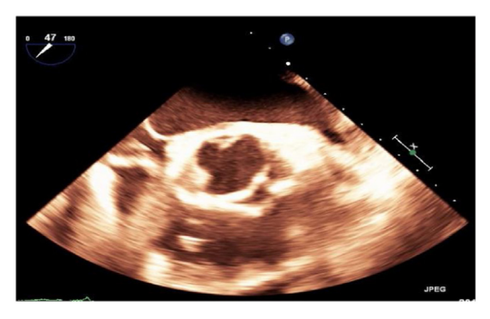
Fig. 5. Transesophageal echocardiography (TEE) showed small, mobile vegetation on the non-coronary cusp of the aortic valve and thickened aortic root.

right atrium and moderate aortic valve vegetation. The mitral valve was thicken suggesting a possible microperforation of the mitral valve. There was a mobile echodensity noted on the posterior mitral valve, measuring 0.3 \times 0.5\,\mathrm{cm} and mild-moderate mitral valve regurgitation.