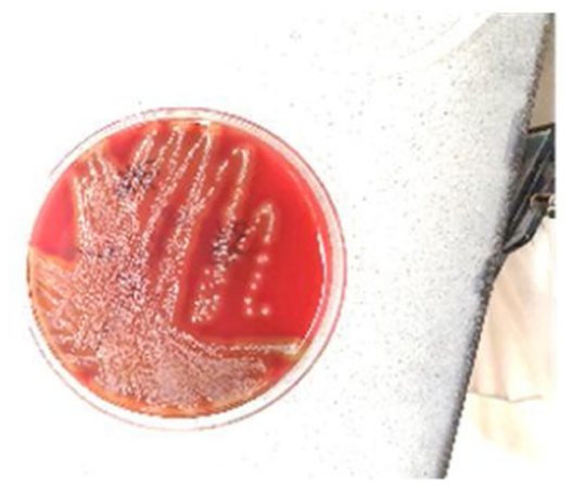
Fig. 3. Group C Streptococcus dysgalactiae subsp. equisimilis.