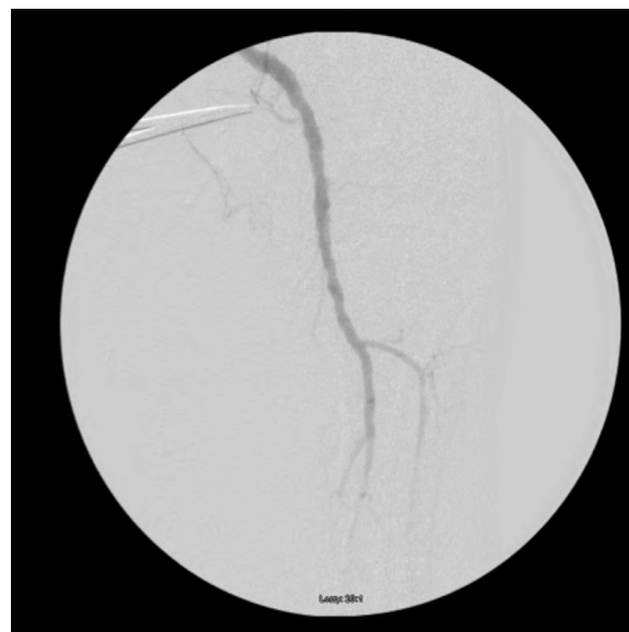
Fig. 3 – Intraoperative angiography showing a patent popliteal artery up to the level of the trifurcation with chronic disease in the runoff vessels.