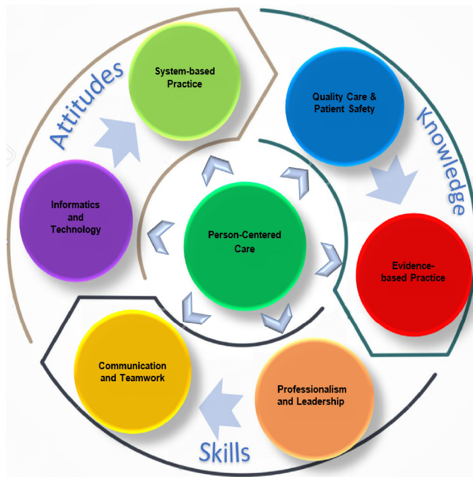
Figure 2. Core Competency Framework for Undergraduate Nursing Student.