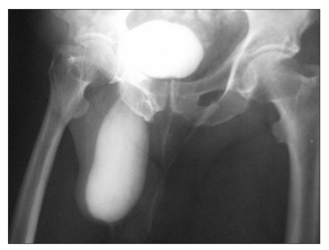
Figure 2: Conventional radiograph of a 73-year-old male with dumbbell shaped urinary bladder in a right inguinal hernia. Retrograde cystogram shows the bladder being filled with contrast. Part of it is in the pelvis and the rest in the right inguinal hernia which appears like a 'dumbbell' and feeding tube in hernia sac