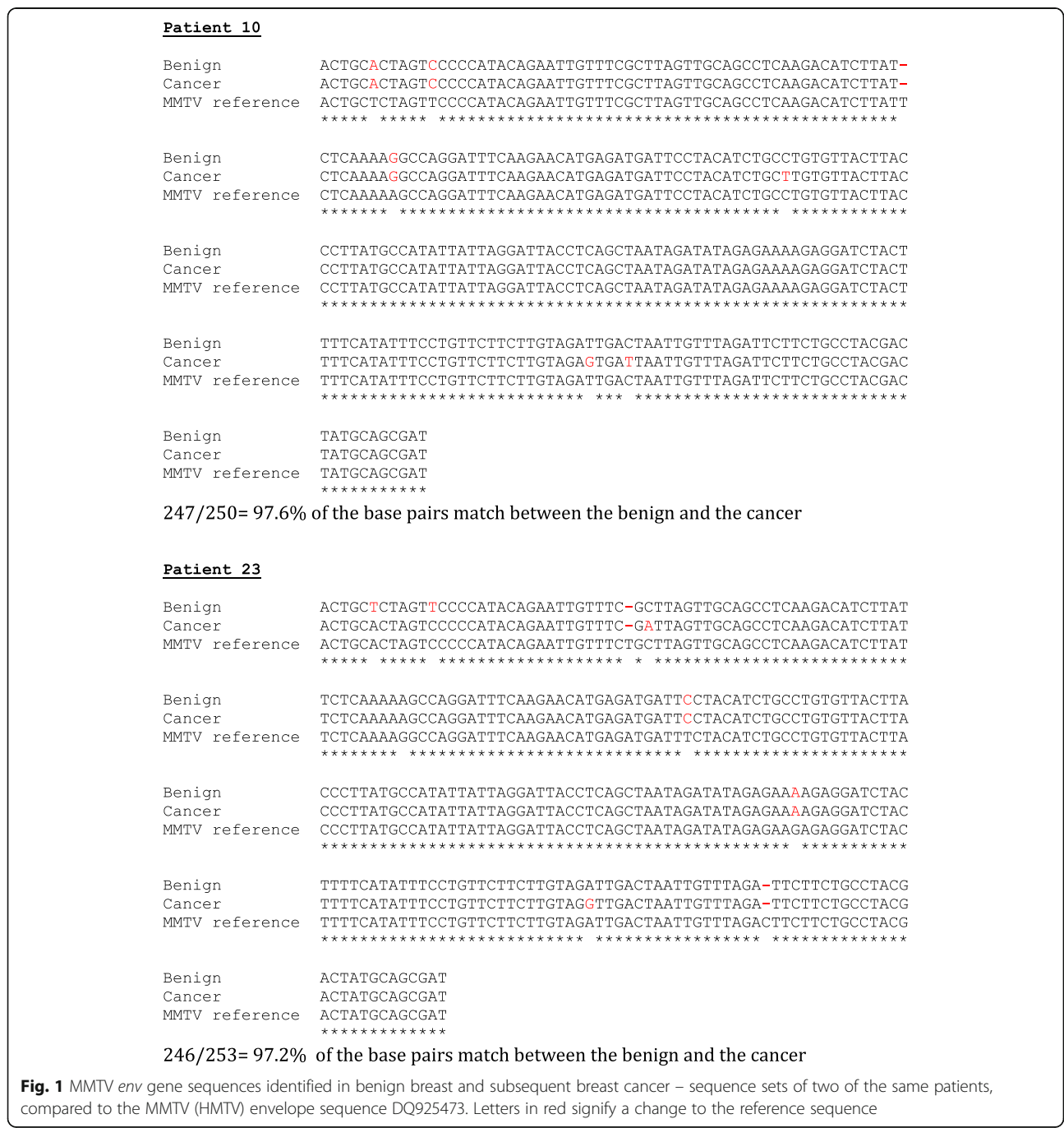
Fig. 1 MMTV env gene sequences identified in benign breast and subsequent breast cancer – sequence sets of two of the same patients, compared to the MMTV (HMTV) envelope sequence DQ925473. Letters in red signify a change to the reference sequence

in 2 selected patients. These sequences are shown in Fig. 1. There are variations in approximately 3% of the sequences between the benign and subsequent breast cancers that developed several years later in the same patients. Such variations could be due to alterations in the MMTV-like genome following integration into the human genome as has been described for murine retroviruses [28] or could also occur during the PCR cycling procedures. These sequence variations indicate that contamination during PCR analyses was unlikely.