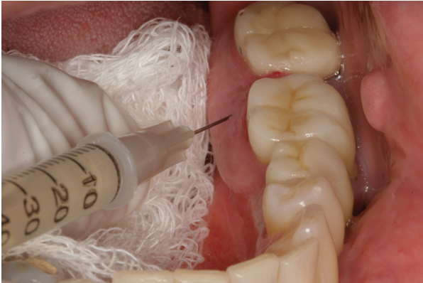
Fig. 2: Treatment with 0.1 mL of the 2.5% monoethanolamine oleate of gingival.