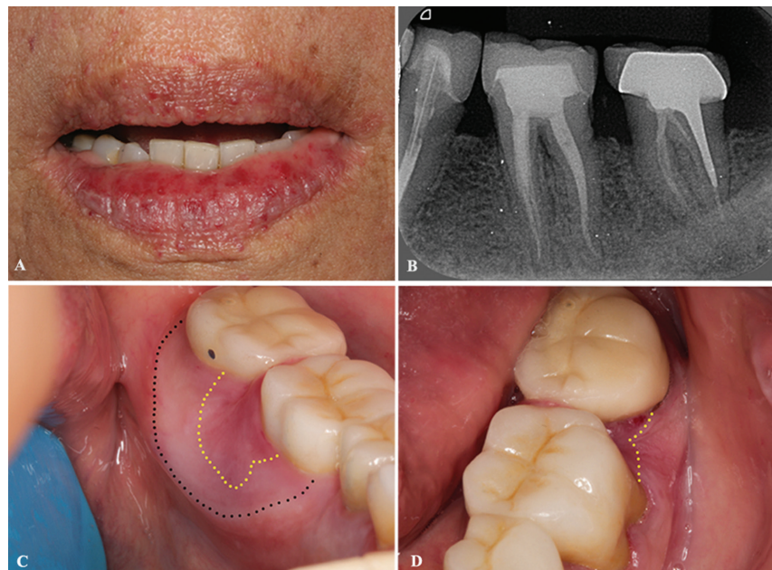
Fig. 1: A) Extraoral view of the patient, multiple punctate erythematous macules on the upper and lower lips are noted. B) Periapical radiograph demonstrated endodontic treatments in the mandibular second left premolar, first and second left molars, but no changes associated with the alveolar bone. C,D) Clinical presentation of the lesion, red macula on lingual and vestibule gingiva (yellow dotted), and gingival swelling on lingual (black dotted). C) Lingual view; B) Vestibular view.

The varices regressed after two therapy sessions, and according to the patient, the spontaneous bleeding has stopped (Fig. 3). Lingual swelling remains with no alterations; it was diagnosed as hypertrophic gingiva. No recurrence was observed after 18 months.