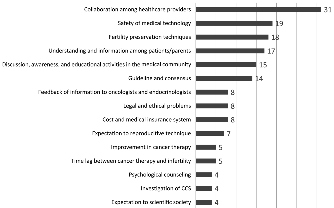
Fig. 2. Categorization of the aspects necessary to maintain gonadal function or preserve fertility in pediatric cancer patients, as provided by the 71 pediatric endocrinologists who gave written answers to the open question.

need for “collaboration among physicians and other healthcare providers in various disciplines”, followed by “safety of medical technology”, “fertility preservation techniques”, “obtaining understanding and providing information to patients and their families”, “discussion, awareness, and educational activities in the medical community”, and “guidelines and consensus” (Fig. 2).