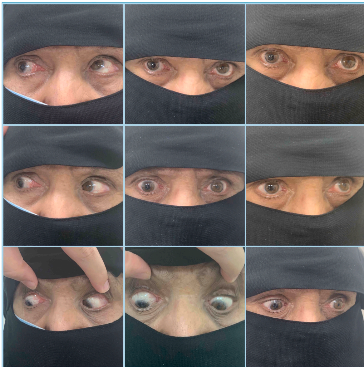
Fig. 3. 6-Months composite postoperative photo showing all nine gazes with small exotropia at primary gaze, mild adduction limitation of the right eye, and marked improvement in her abductions.

joined together with a 5–0 Dacron suture. 4 Most cases in literature detail minor alterations to the surgical techniques mentioned above, such as additional MR recession, use of botox, scleral fixation, type of suture used, or the use of silicone bands. 5 Scleral fixation provides better stability at the expense of increased risk of perforation, whereas silicone band without scleral fixation has the risk of migration. 9