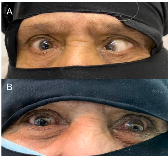
Fig. 1. (A) Preoperative photograph showing a large angle esotropia. (B) 4-weeks postoperative photo showing mild exotropia at primary gaze.

with the method of Yokoyama et al. 2 The LR-SR band was qualitatively assessed as thinning, discontinuity, or displacement by examining adjacent quasicoronal image planes. The treating physician decided to plan for loop myopexy with a scleral band in both eyes plus bilateral medial rectus (MR) recession. Under general anesthesia, forced duction test showed bilateral tightness in abduction and supraduction. Intraoperatively, there were encircling style 240 scleral buckles in both eyes placed almost 15 mm from the limbus. The MR was approached through a fornix incision and recessed 8 mm using a hang-back technique. Then, through a superotemporal fornix incision, the nasally displaced SR was hooked and isolated from the surrounding attachments. The same was done for the LR, which had been displaced inferiorly. Manipulation of the existing scleral buckle was avoided to prevent avoidable retinal