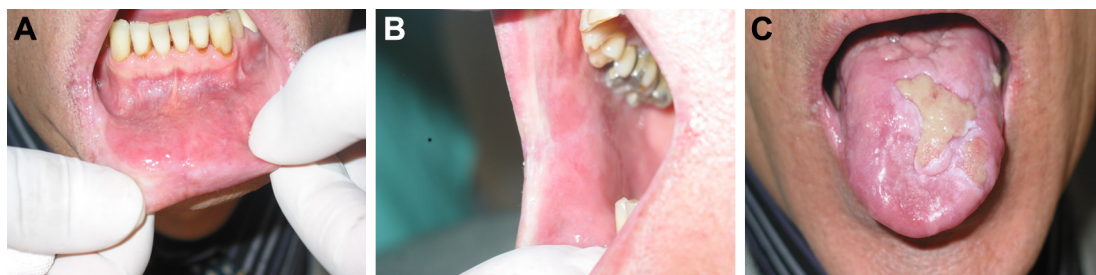
Figure 3 (A and B) Complete healing of the lesions on the lower lip and buccal mucosa was observed. (C) Remarkable improvement in the lesion on the dorsal tongue was seen after treatment.

The prognosis of patients with a thymoma with immunodeficiency is thought to be worse than for those with other immunodeficiencies. 4 In contrast to a thymoma with immunodeficiency, the common variable immunodeficiency, which is also characterized by hypogammaglobulinemia, is associated with less frequent and less severe cellular immunodeficiency and fewer opportunistic