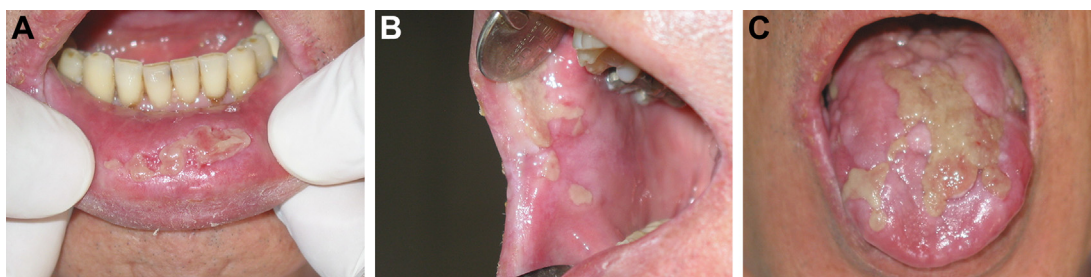
Figure 1 (A) Discrete erosive lesion covered by a yellowish-white fibrinous exudate with surrounding mucosal erythema on the lower lip labial mucosa; (B) appearance of the right buccal mucosa before treatment; and (C) well-demarcated, indurated, and thickened yellowish-white plaques and nodules on the dorsal tongue.

Blood samples were collected on the same day. Results of a laboratory examination revealed the following: white blood cell count, 4600/mm 3 ; hemoglobin, 12.2 g/dL; platelet count, 152,000/mm 3 ; C-reactive protein, 10.6 mg/L; total protein, 6.21 g/L; and albumin of 4.48 g/dL. Laboratory data included the following: low immunoglobulin G (IgG), 5.91 g/L (normal: 800–1600 mg/dL); IgA, 0.25 g/L (normal: 80–400 mg/dL); and IgM, 0.17 g/L (normal: 50–180 mg/dL). A lymphocyte subset analysis of