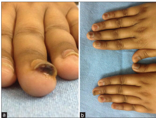
Figure 1: (a) Bulbous swellings of the finger tips with subungual hemorrhages. (b) Orange-brown discoloration of nail plate and orange-red Beau's line, with varying degrees of dystrophic changes and subungual abscess formation

The lady, who was receiving adjuvant chemotherapy with trastuzumab–docetaxel combination (2 mg/kg and 70 mg/m 2 , respectively) presented with painful swelling of the digits with subungual deposition of blood and pus within a week of the 4 th chemocycle. On examination, all nails revealed bulbous swellings with varying degrees of subungual hemorrhages and dystrophic changes [Figure 1a]. Nail changes included orange-brown discoloration of the nail plate, orange-red Beau's lines [Figure 1b], acute paronychia with subungual abscess formation, and varying degrees of hemorrhagic onycholysis [Figure 2a]. Fungal stains and fungal and bacterial cultures from the nail clippings and subungual pus were negative. Histopathology of the nail plate confirmed drug-induced acute inflammatory onychopathy. Docetaxel was stopped after the sixth cycle; oral antibiotics and anti-inflammatory drugs were prescribed, but trastuzumab was continued for the remaining 6 cycles.