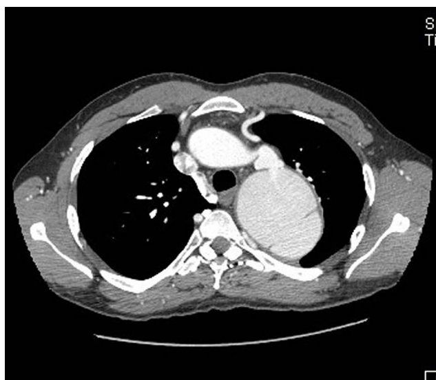
Figure 1 Axial view of preoperative CT-scan. Note the coarctation/kinked segment and dissected aneurysm.

healthy thoracic aorta. The aneurysm was excluded completely and no endo-leak was noticed. Post-dilatation was not needed. We did not use any spinal cord protection and the patient was extubated on the operation table, without any motor or sensory deficit of lower extremities. Patient had an uneventful course and was discharged 1 week later. He is normotensive and is using only bisoprolol 2.5 mg daily. He remains asymptomatic to this day and the last CT-scan at 3-year follow-up revealed a totally thrombosed aneurysm which has shrunk by 2 cm in diameter (Figure 2).