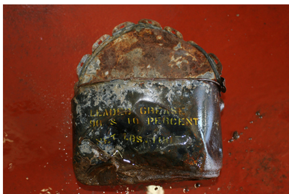
Figure 3 Metal container recovered from the pasture where twelve heifers were found dead.

Remaining cattle had the potential to be subclinical so the owners were advised to spot test for blood lead levels. Direct correlation between blood and milk lead levels has been demonstrated, 40 posing a potential health risk, but in this case, the animals were not to be bred for several months and would not enter the milk production stream for another 12 months. At that time, it would be unlikely for lead to remain an issue but still advisable to test milk upon lactation.