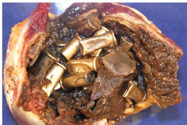
Figure 1 Gizzard of a 20-week-old chicken containing 19 mostly intact 0.22 rim fire shell casings. Case not part of this case series. Image for illustration purposes only.

Notes: The bird died from lead poisoning, confirmed by liver lead concentration of 22 mg/kg wet weight, had weight loss, inappetence, and listlessness, and was the seventh chicken from this flock to have died. Free-ranging flock (4047 m 2 ) with coop in Kern County, CA, USA.